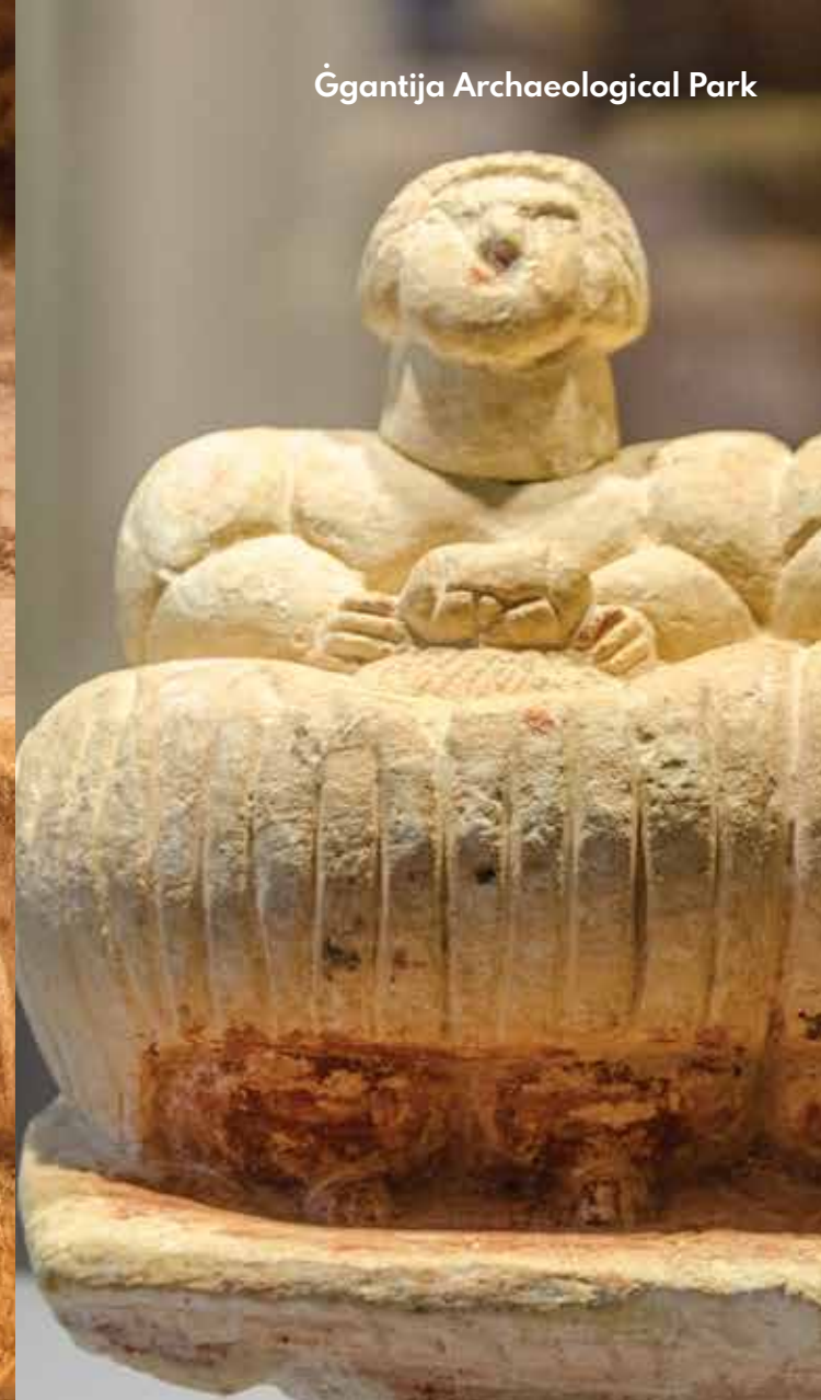
Ġgantija Archaeological Park