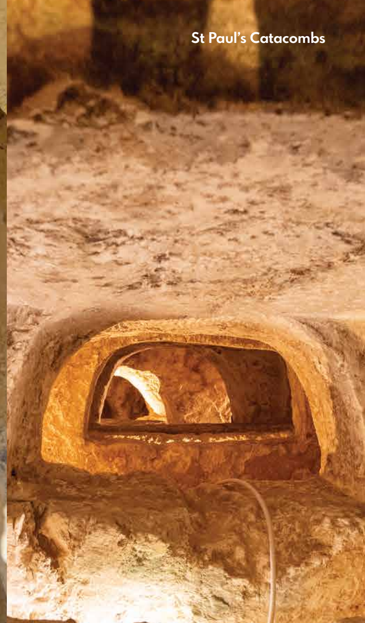
St Paul's Catacombs