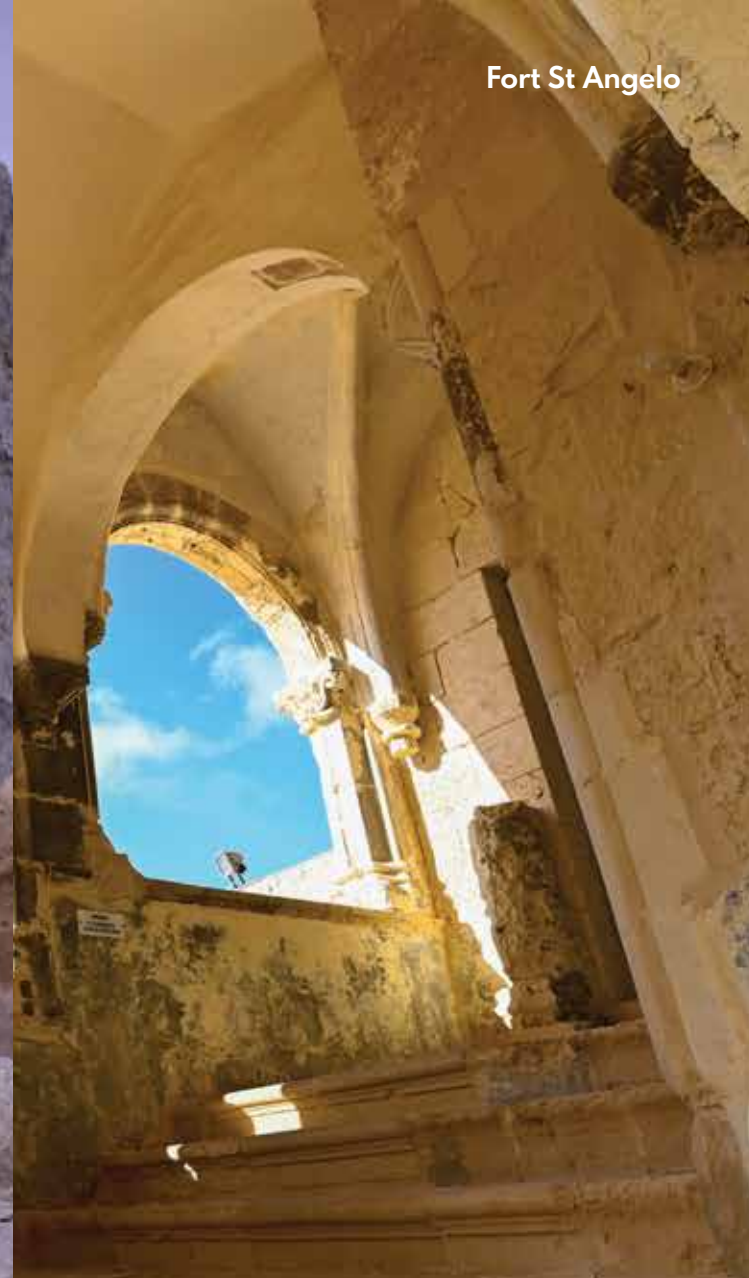
Fort St Angelo