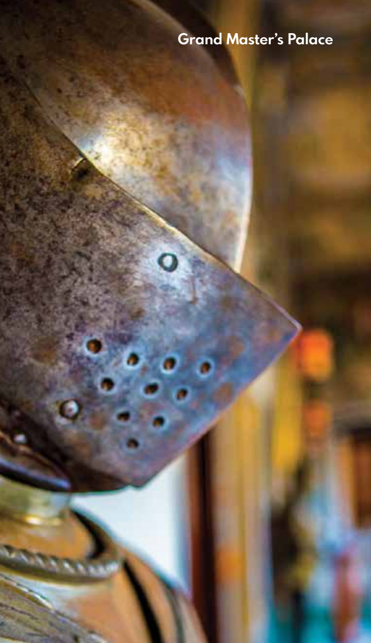
Grand Master's Palace

Heritage Malta Combo & Multisite Tickets