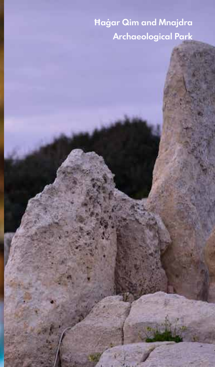
Haġar Qim and Mnajdra Archaeological Park