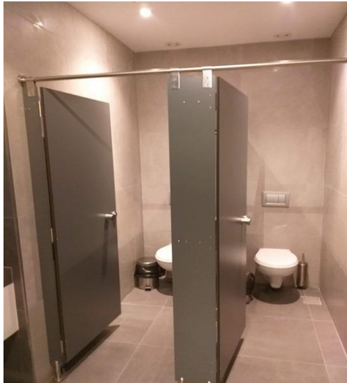
Figure 13: First Floor Ladies Restroom