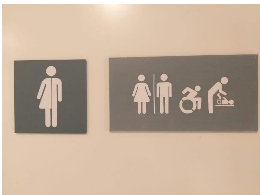
Figure 15: Restroom signage

Another important tool to help with visitor orientation is the way-finding signs along the floors. Throughout the museum there are visible panels which indicate for instance where the reception, galleries, restrooms and lockers are located. Whilst in the galleries themselves there are also panels which indicate the visitor's different section of the galleries. Furthermore, every artwork is labelled with a caption, all of which are written in a large format both in Maltese and English.