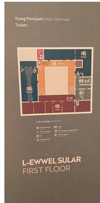
Figure 19: Map of first floor