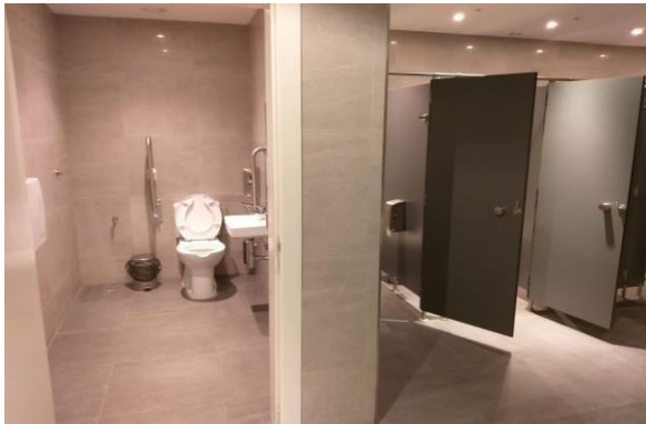
Figure 11: Ground floor unisex restrooms

Next to the restrooms there is a lift which can be used by people in possession of a wheelchair, pushchair etc. Besides, there is also a small seating area just in front of the lift where visitors can rest.