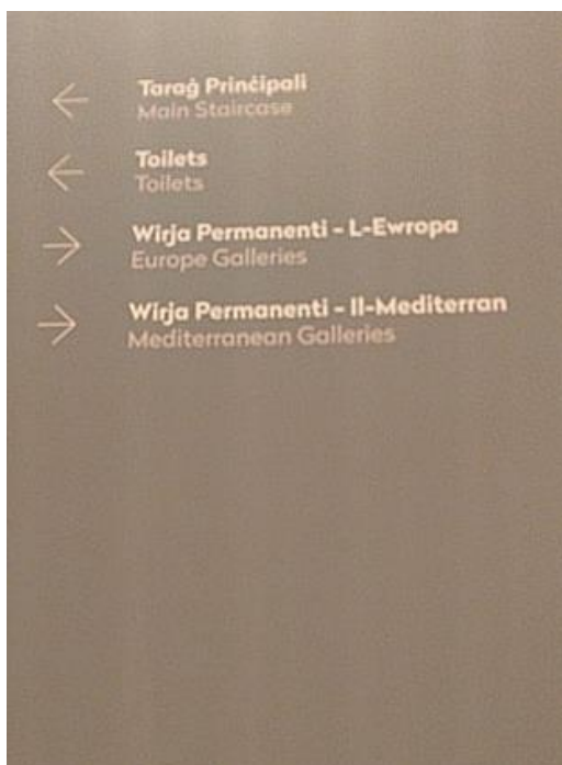
Figure 20: Sign panel found in First floor galleries.