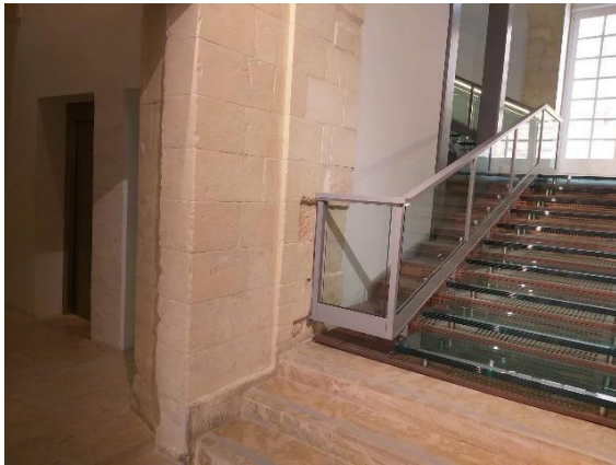
Figure 7: Staircase + the lift on the left side of the picture (found at Ground floor level).