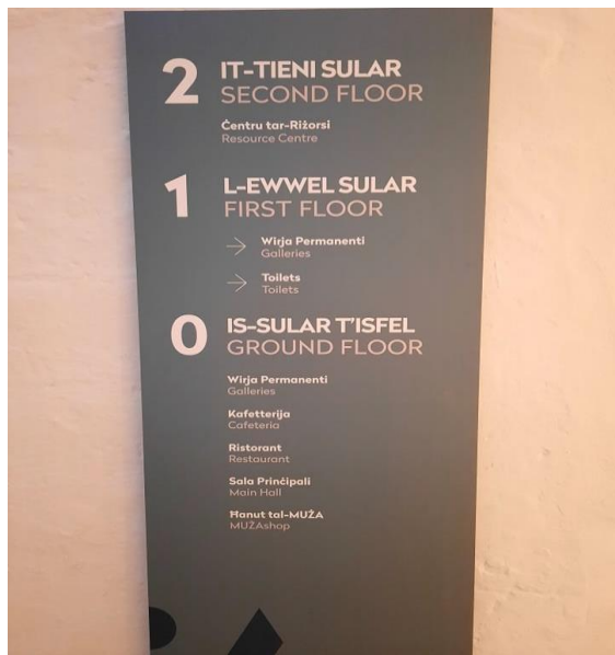
Figure 18: Sign panel with information about every floor