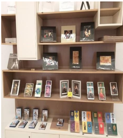
Figure 3: Items found at MUZA Gift shop.

Once entering the right-hand side door from the main entrance one can immediately view the reception desk and the gift shop. From MUŻA’s gift shop, visitors will be tempted to buy something from the variety of selection found there targeting different ages. Some of the items include postcards, small souvenirs, stationary items such as pencils, HM notebooks, brick eraser, colouring books for children, MUŻA branded T-shirts for both adults and kids, puzzles, art books, history books and cooking books amongst others. Furthermore, many of these books are available in different languages. All the signage and prices are clear and visible.