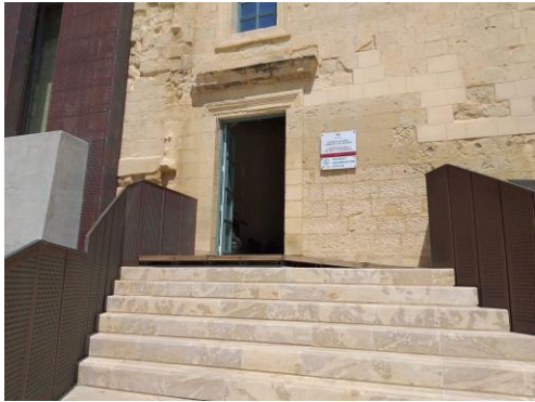
Figure 2: Entrance to the Museum from Piazza de La Vallette