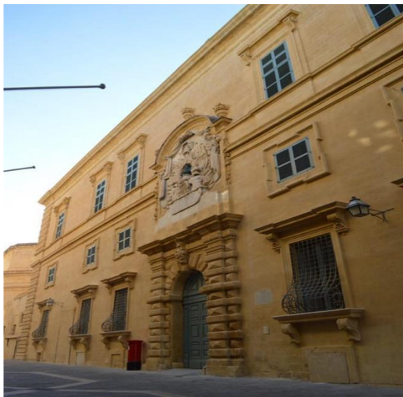
Figure 1: Main entrance to MUZA museum

The main entrance of MUŻA is found at Ground floor at Merchant Street. On the right-hand side, one will find a door together with two steps to enter the MUŻA reception. MUŻA reception may also be accessed through alternative access for all entrances at the corridor leading to the central courtyard.