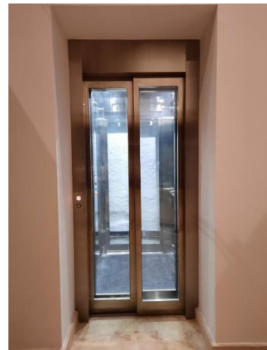
Figure 10: lift found in First floor galleries.