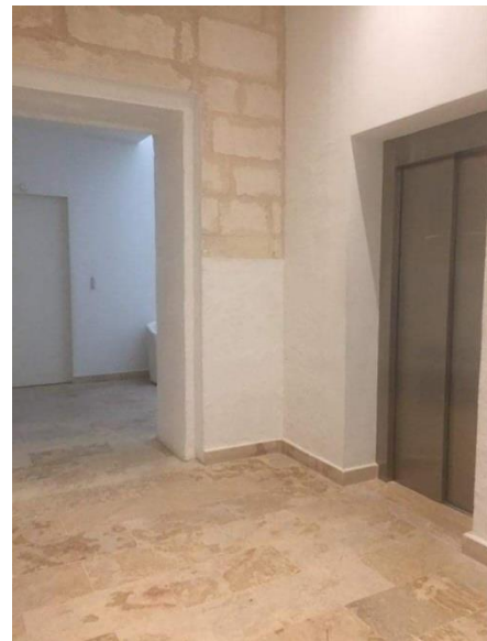
Figure 13: The elevator next to the First Floor Restrooms