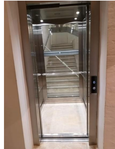
Figure 7: lift next to the staircase (found at Ground floor level).