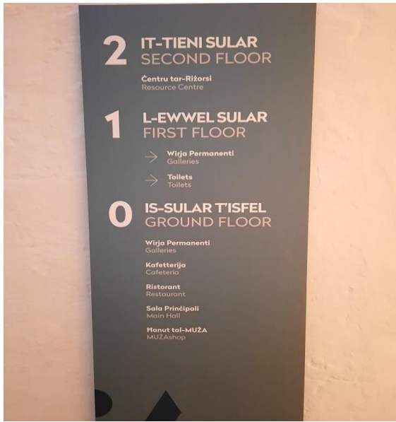
Figure 17: Sign panel with information about every floor