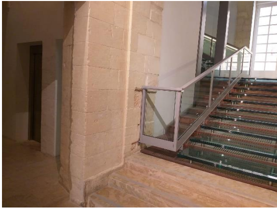
Figure 6: Staircase + the lift on the left side of the picture (found at ground floor level).