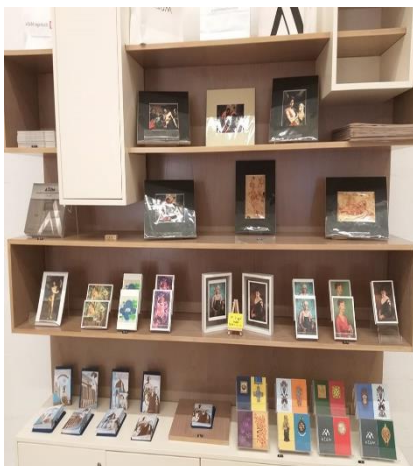
Figure 3: Items found at MUZA Gift shop

Once entering the right-hand side door from the main entrance one can immediately view the reception desk and also the gift shop. From the MUZA's gift shop, visitors will be tempted to buy something from the variety of selection found there targeting different ages. Some of the items include postcards, small souvenirs, stationary items such as pencils, HM notebooks, brick eraser, colouring books for children, MUZA branded T-shirts for both adults and kids, puzzles, art books, history books and cooking books amongst others. Furthermore, many of these books are available in different languages. All the signage and prices are clear and visible.