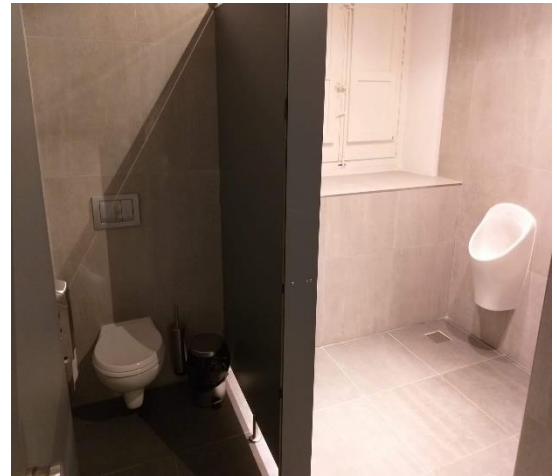
Figure 11: First Floor Men's Restroom