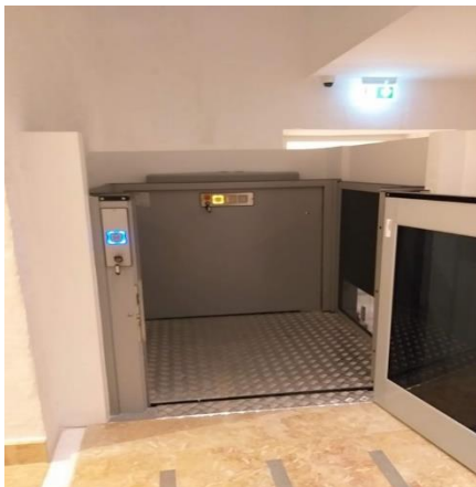
Figure 8 disabled elevator found inside the first-floor galleries.