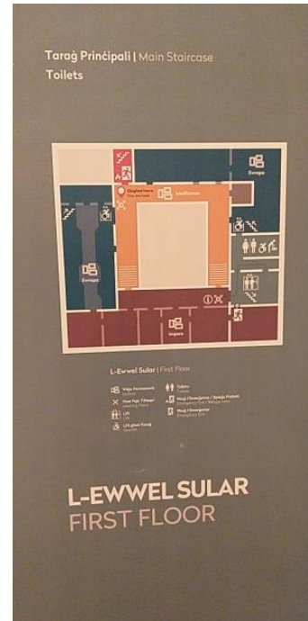
Figure 18: Map of first floor