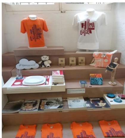
Figure 4: Price Tags Infront of items