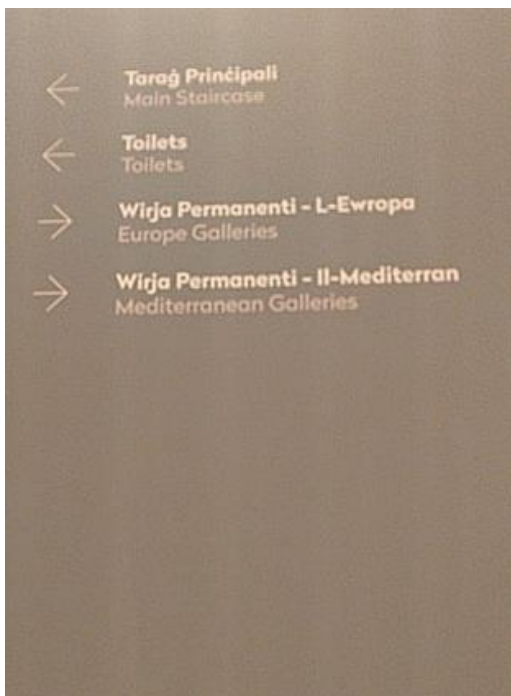
Figure 19: Sign panel found in First floor galleries