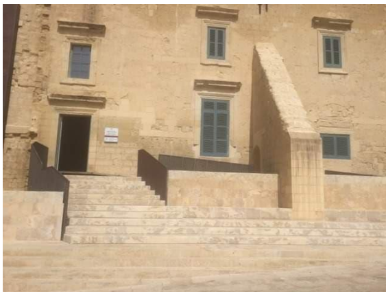
Figure 20: Entrance to MUŻA Restaurant

Together with the museum, there is also a Restaurant located within the remit of MUŻA public space. It opens beyond the museum's opening hours and it is conceived as an extension of the museum experience. Upon approaching the museum through De Valette Square, one can enter by going up the stairs found in front of the entrance. Those with wheelchairs or pushchairs can easily make use of the ramp found on the right-hand side of the entrance.