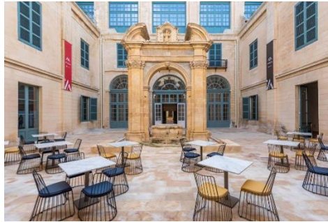
Figure 21: MUZA Courtyard

Mediterranean weather, to hang out or to just get inspired following your visit to the museum galleries.