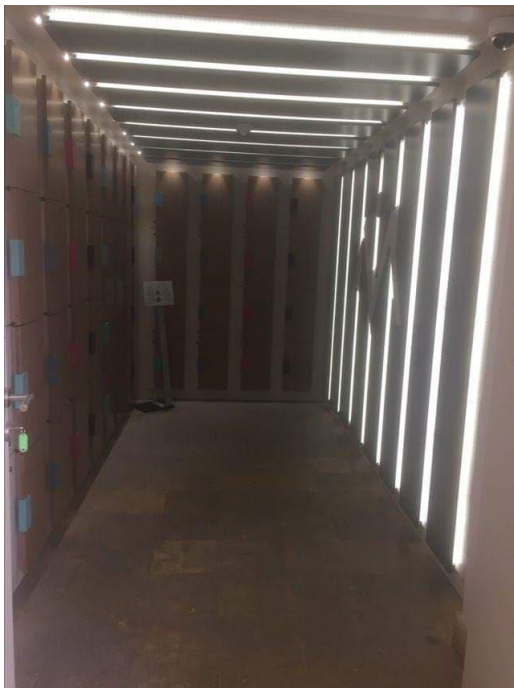
Figure 5: Locker room at ground floor level

Once visitors purchase their tickets, the Front of house (FOH) personnel will give instructions to visitors to place their bags in the locker room. Visitors are given a key to one of the lockers which they return back to the reception before leaving. The locker room is situated next to the Tourist information office, the FOH personnel explain the procedure to the visitors once purchasing the ticket. After placing their bags in the lockers, visitors will be directed to proceed through self-operated turnstiles (found in front of the Museum reception) to start their tour from the ground floor galleries.